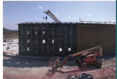
Construction of a new concrete reservoir (capacity of 3.4 million gallons) on Alta Rd.