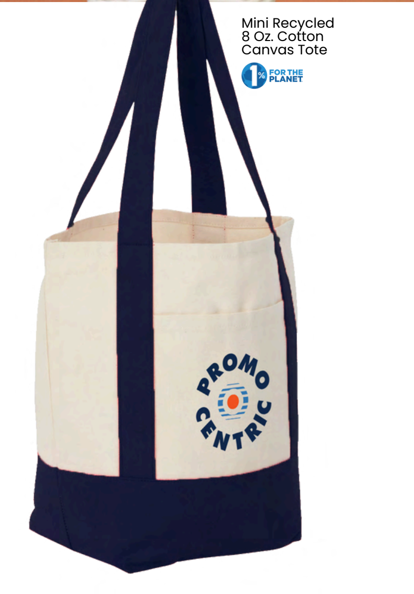
Mini Recycled 8 Oz. Cotton Canvas Tote