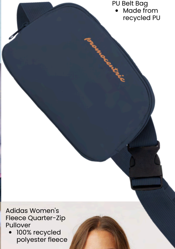
Venturer Recycled PU Belt Bag • Made from recycled PU