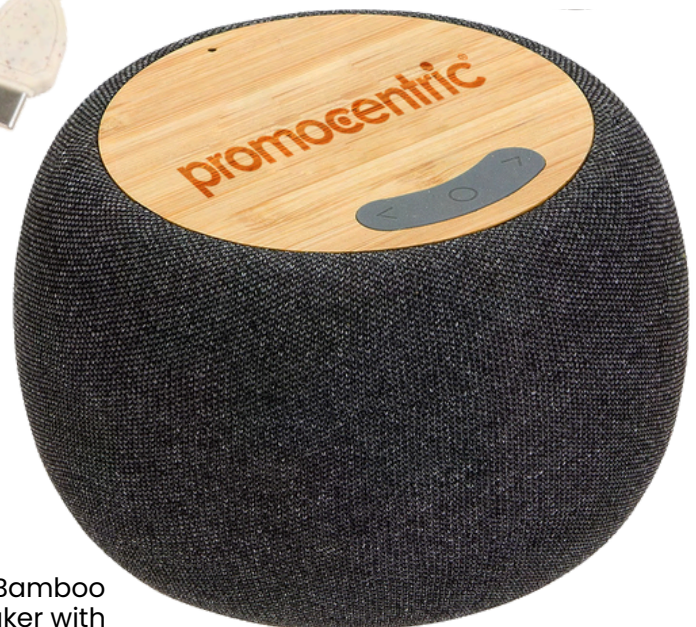
Empire Bamboo Wireless Speaker with 5W Wireless Charger