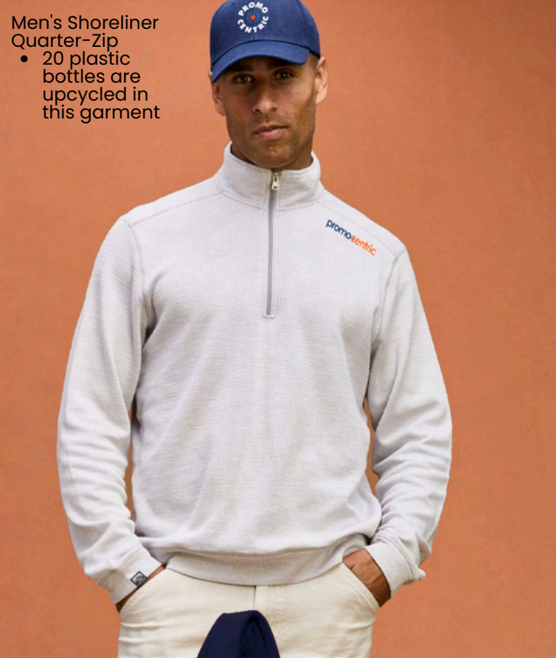
Men's Shoreliner Quarter-Zip • 20 plastic bottles are upcycled in this garment