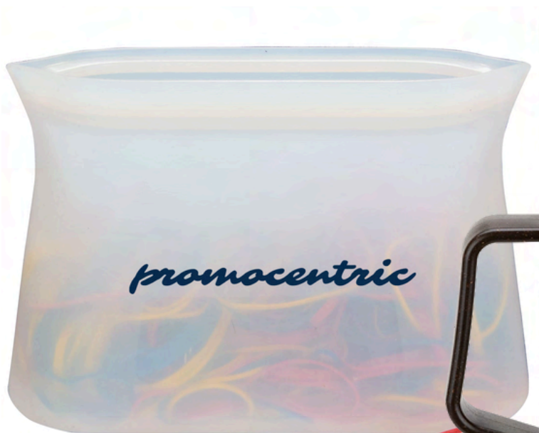
Zili Silicone Food Storage Bag 16 Oz.