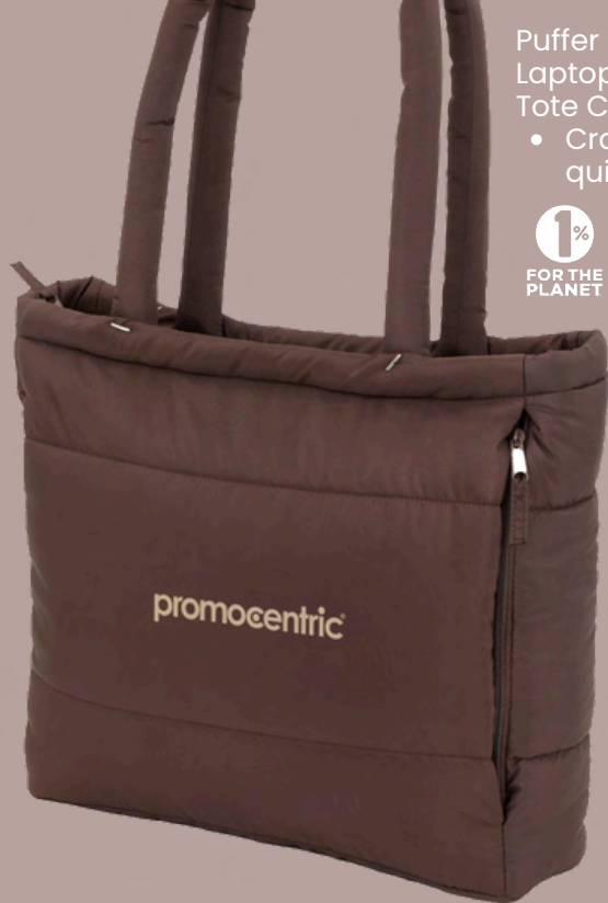
Puffer Recycled 15" Laptop Tote and 9 Can Tote Cooler