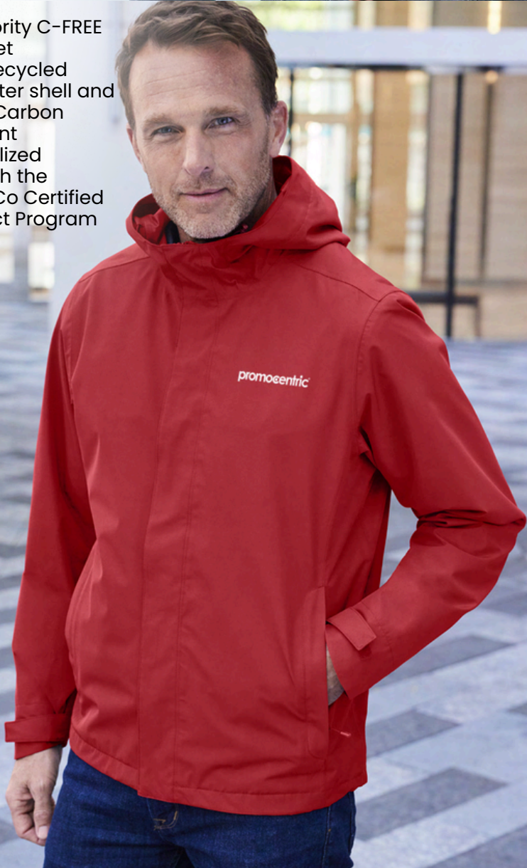
Port Authority C-FREE Rain Jacket • 100% recycled polyester shell and lining Carbon footprint neutralized through the ClimeCo Certified Product Program