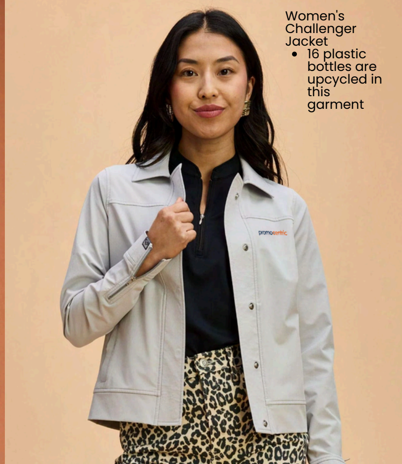
Women's Challenger Jacket • 16 plastic bottles are upcycled in this garment