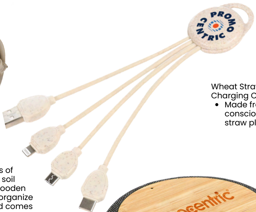
Wheat Straw 3-in-1 Charging Cable